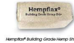
Hempflax® Building Grade Hemp Shiv