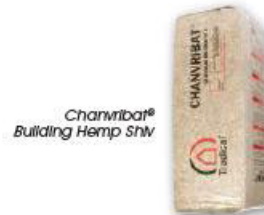
Chanvribat® Building Hemp Shiv