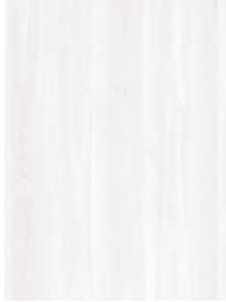
100 Mystic Oak