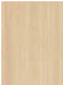
520 Dune Oak