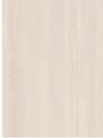
110 Driftwood Oak