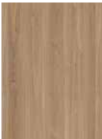
300 Windy Oak