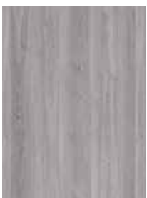
720 Ash Oak