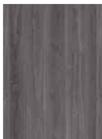
790 Tidal Oak