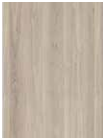
510 Whisper Oak