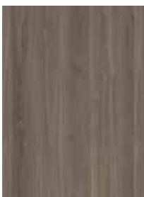
730 Mountain Oak