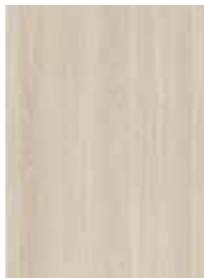
500 Cove Oak