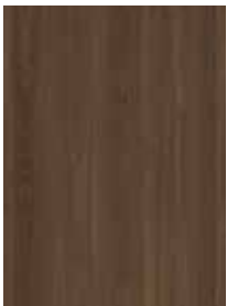
180 Forest Oak