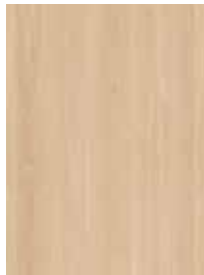
540 Sahara Oak