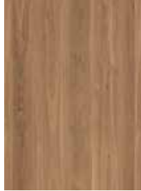
170 Pecan Oak