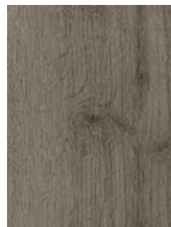
720 Pepper Oak