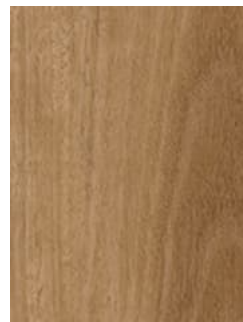
555 Marble Spotted Gum