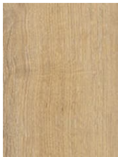
520 Brass Oak