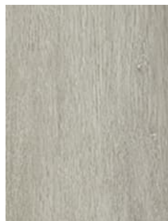
700 Platinum Grey