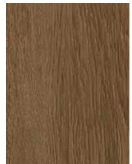
560 Burl Oak