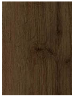
180 Burnt Umber