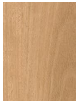
545 Apple-Box Gum