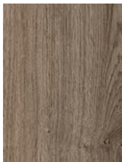
580 Fallow Oak