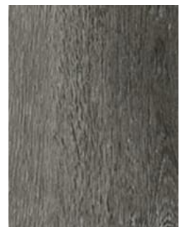
790 Silhouette Oak